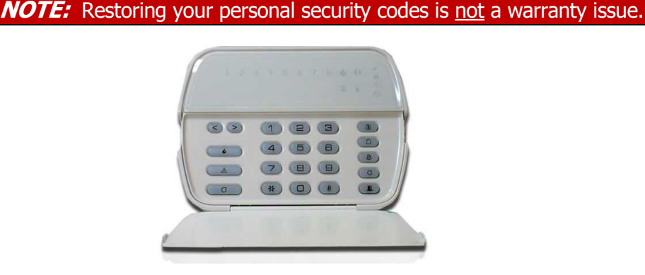
Model: DSC PK5500 Alarm Keypad

The default master code for your system is 1 2 3 4. You may change your master or access codes; however, it is your responsibility to retain these new numbers if you or your tenant changes the master code.