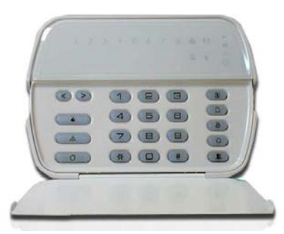
NOTE: Restoring your personal security codes is <u>not</u> a warranty issue.

Model: DSC PC1616 control panels with the DSC RFK5501 keypad