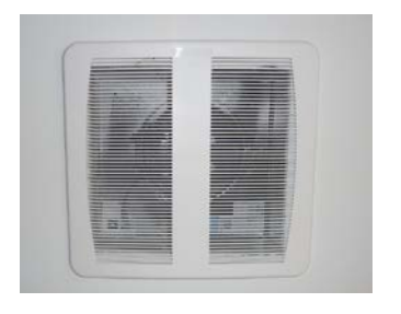
Typical Bathroom Fan